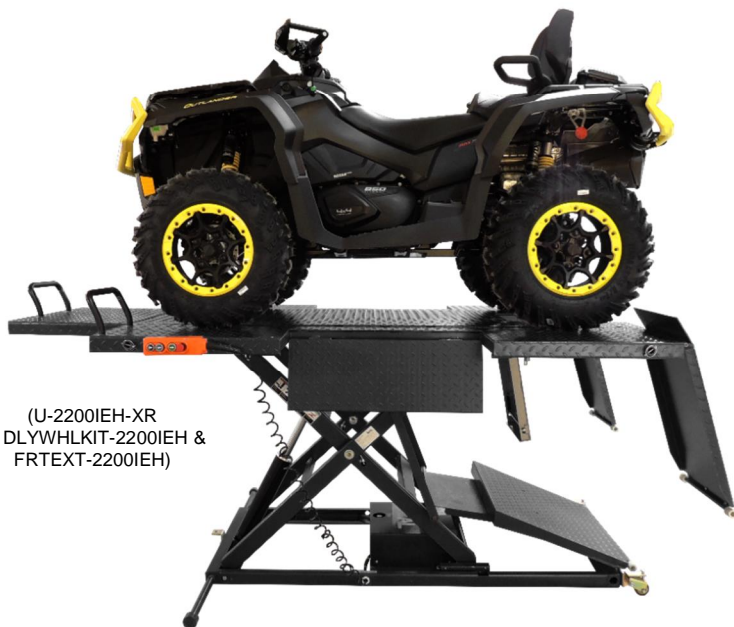
(U-2200IEH-XR w/ DLYWHLKIT-2200IEH & FRTEXT-2200IEH)