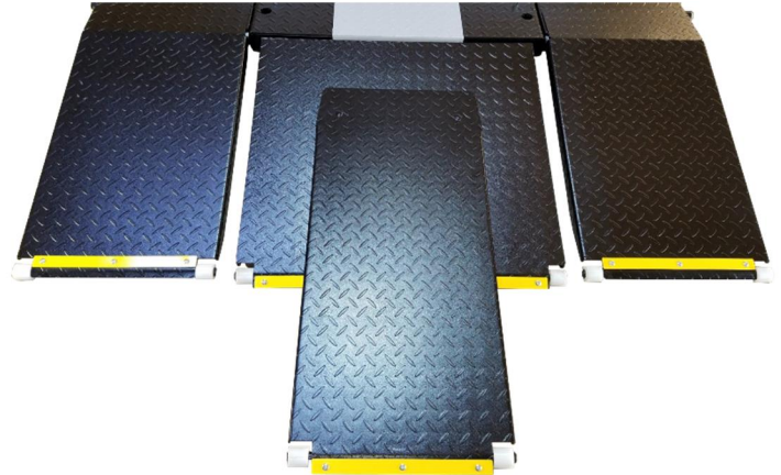
REDUCED RAMP ANGLE WITH 2200IEH-XR RAMP EXTENSION