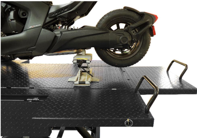
WHEELS FREE SERVICE WITH CYCLE JACK