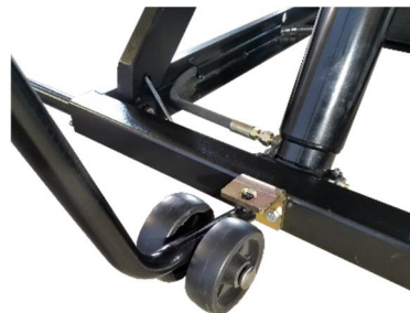
PORTABILITY WITH 2200IEH DOLLY & WHEEL KIT